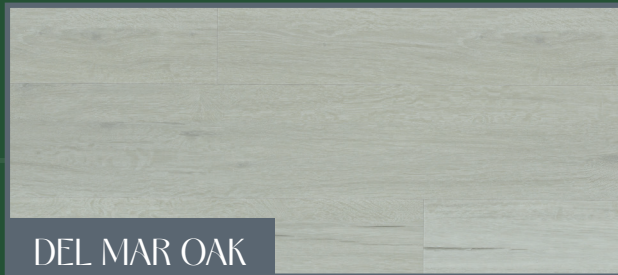
DEL MAR OAK