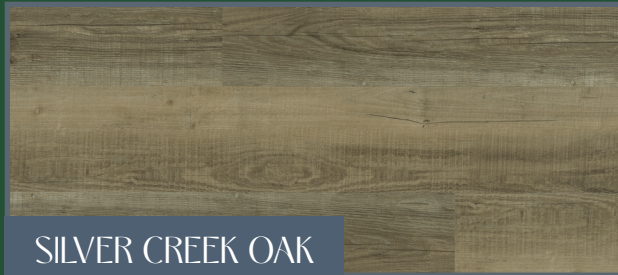
SILVER CREEK OAK